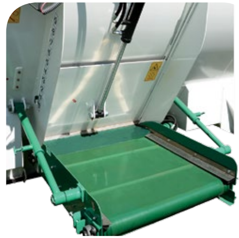
PVC discharge conveyer belt with cleats, moved by hydraulic motor.