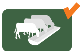
Animal Feed with total feed