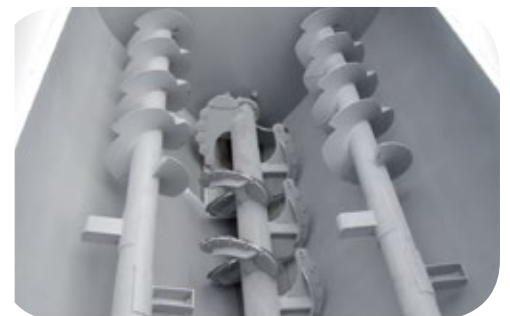
Extra reinforced, segmented lower screw with removable knives.