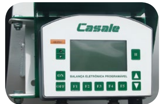
Programmable electronic scale.