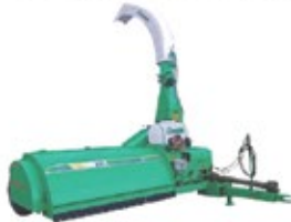
CRC - AP