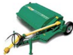
Sega Pasto Mower and conditioner