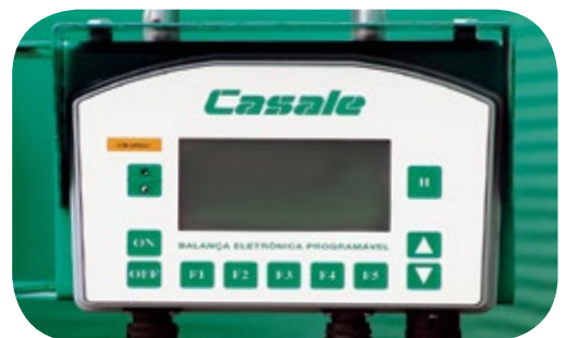
Topnotch programmable electronic scale.