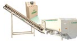
Rotormix Profi Stationary