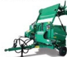
Rotormix Mini Self-loading