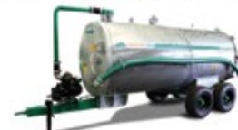
Unitank Liquid manure