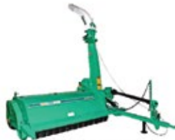
CFC - Super