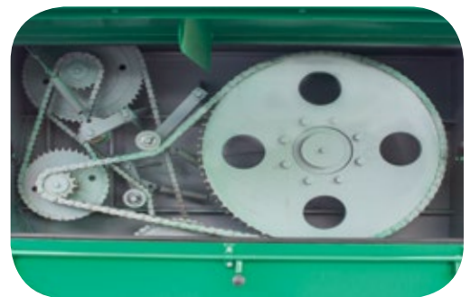
Rear transmission for better equipment weight distribution.