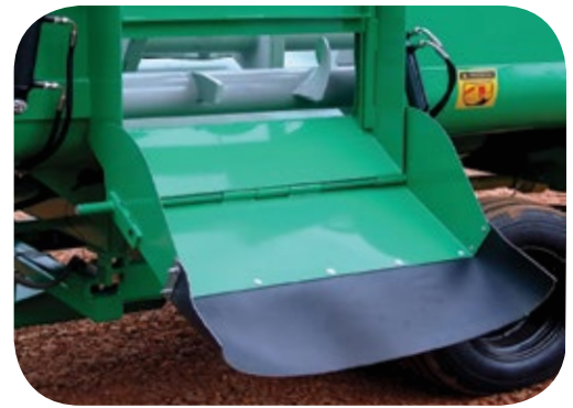
Discharging spout by gravity with extension.