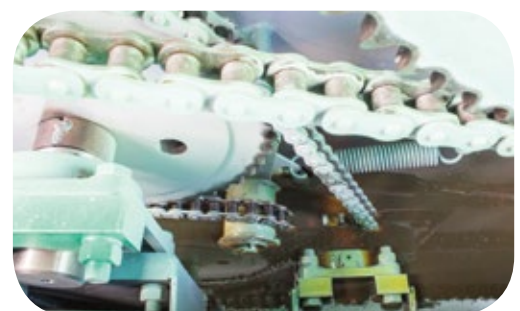
Oiled transmission system.